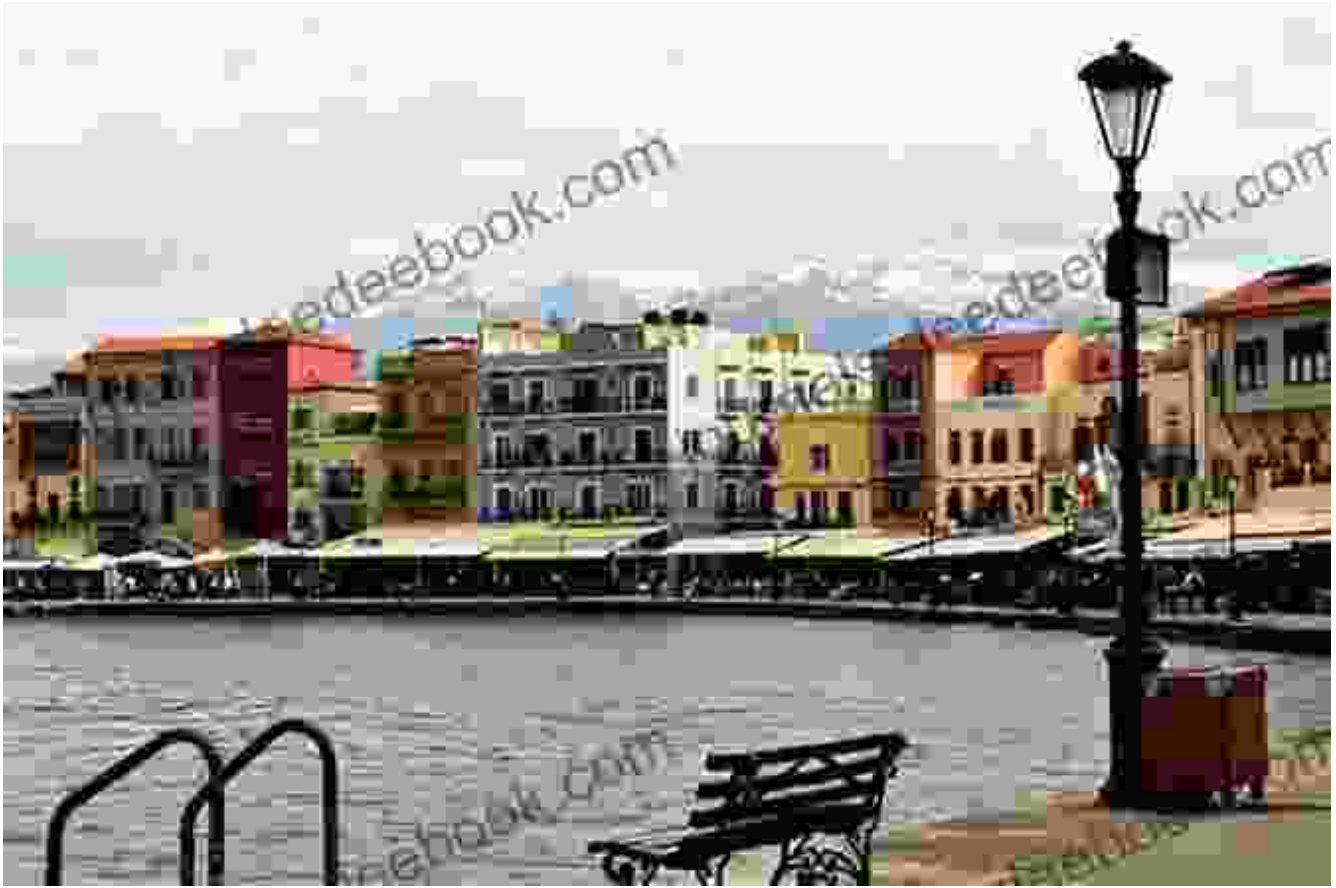
The Venetian harbor in Chania, Crete