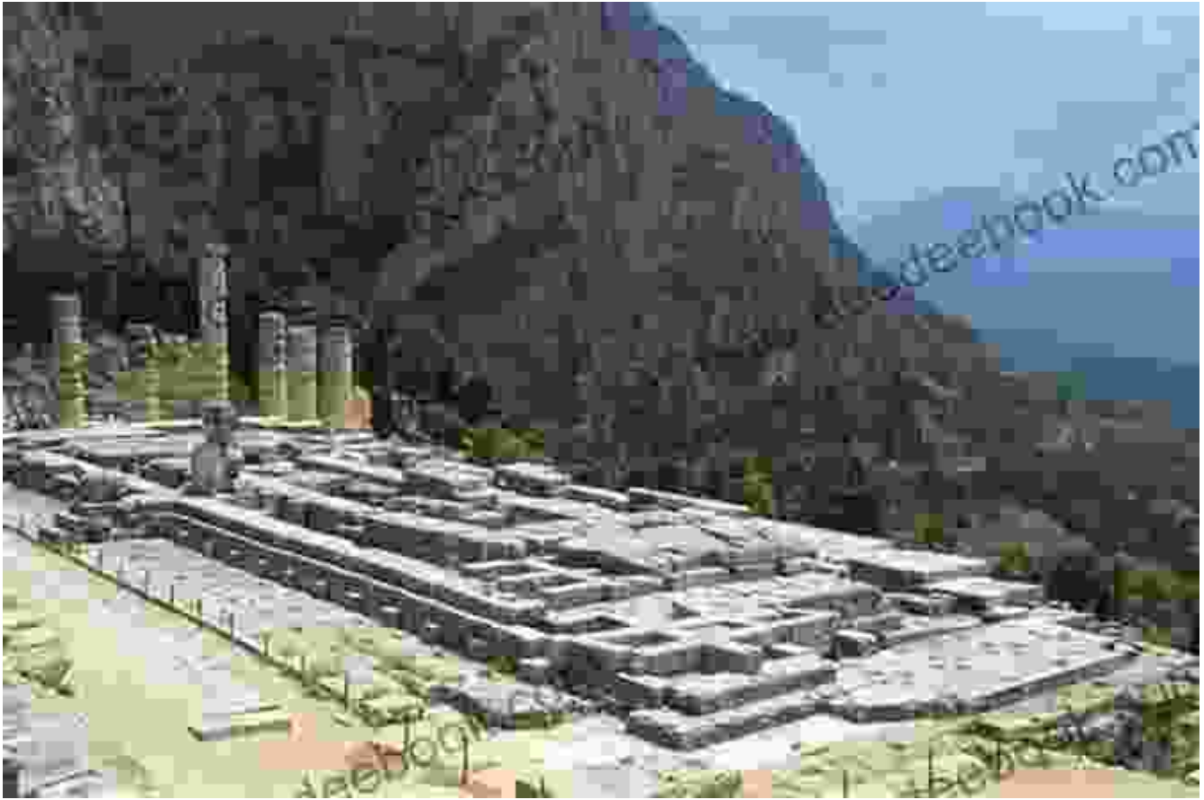
The Temple of Apollo in Delphi, Greece