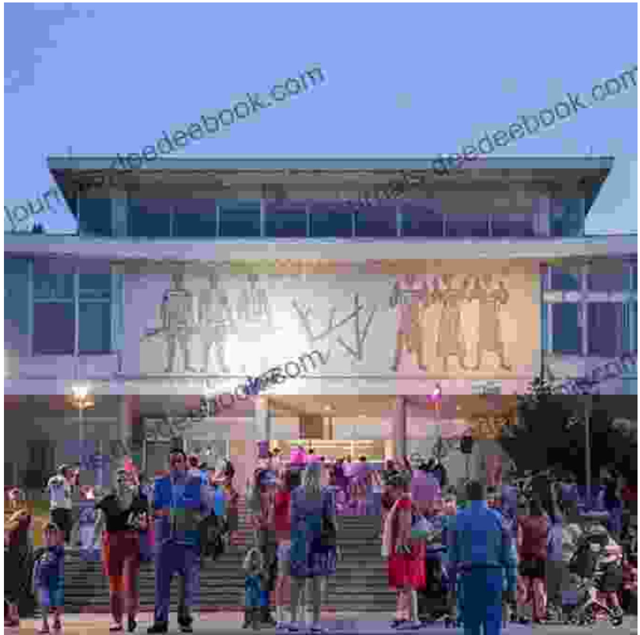
Museum of Yugoslavia

Delve into the history and culture of the former Yugoslavia at the Museum of Yugoslavia. Through interactive exhibits, learn about the political, social, and cultural developments that shaped this complex region.