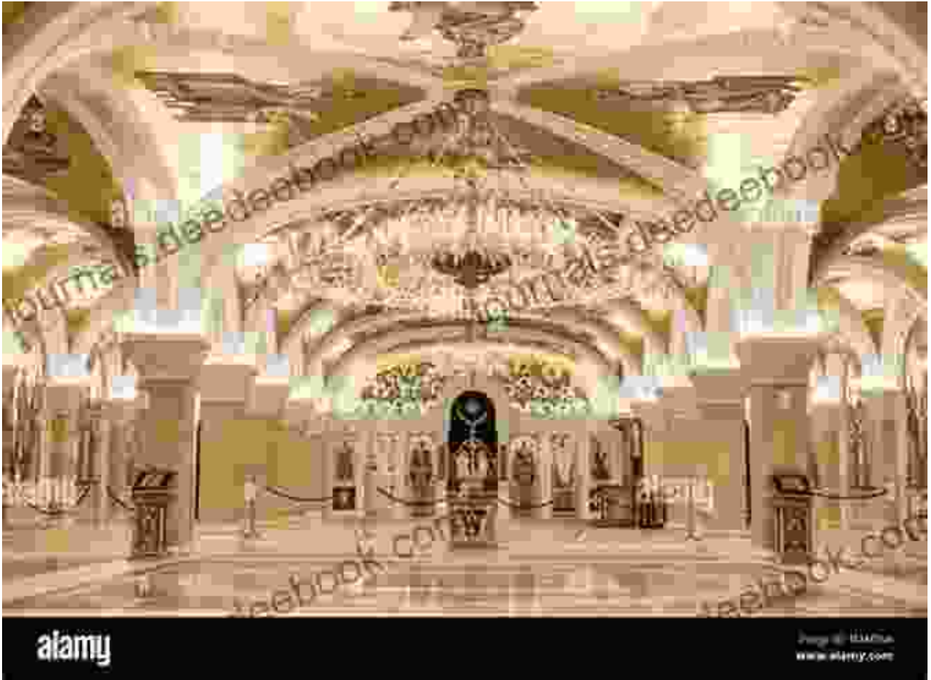
Temple of Saint Sava

Visit the magnificent Temple of Saint Sava, one of the largest Orthodox churches in the world. This stunning architectural marvel is adorned with intricate frescoes and mosaics. Take a tour of the church, admire its grandeur, and learn about its importance to the Serbian people.