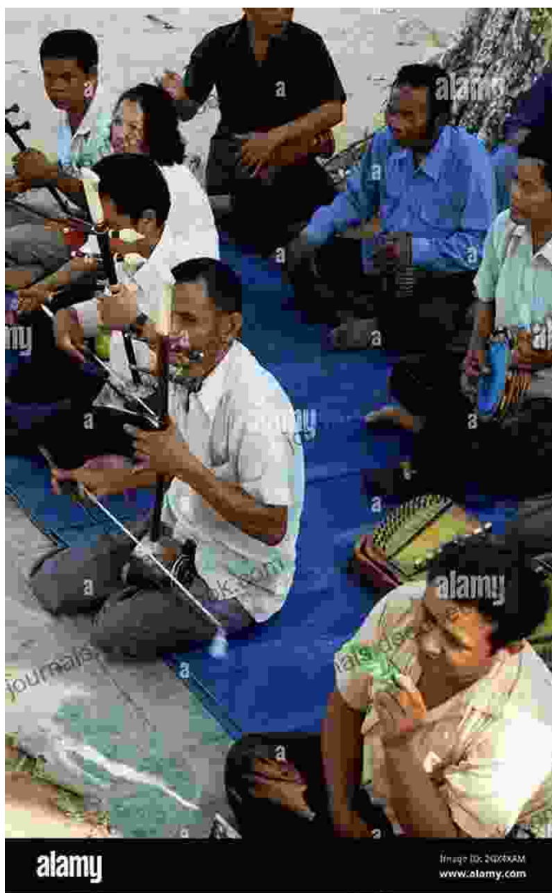
Midwinter Dun Certain Travellers playing traditional music

The Midwinter Dun Certain Travellers lived a nomadic lifestyle, traveling from place to place in search of work and opportunities. They were skilled in a variety of crafts, including metalworking, woodworking, and horse trading. They were also known for their musical abilities and often played traditional instruments such as the fiddle and the tambourine.