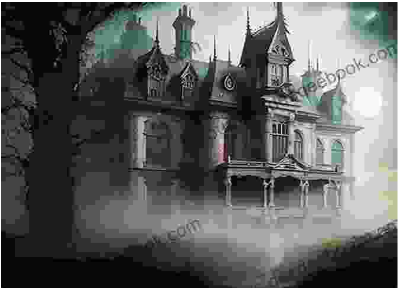
Ravenwood Mansion, Mississippi

The American South is also home to a number of haunted mansions, which are said to be inhabited by the ghosts of their former occupants. These